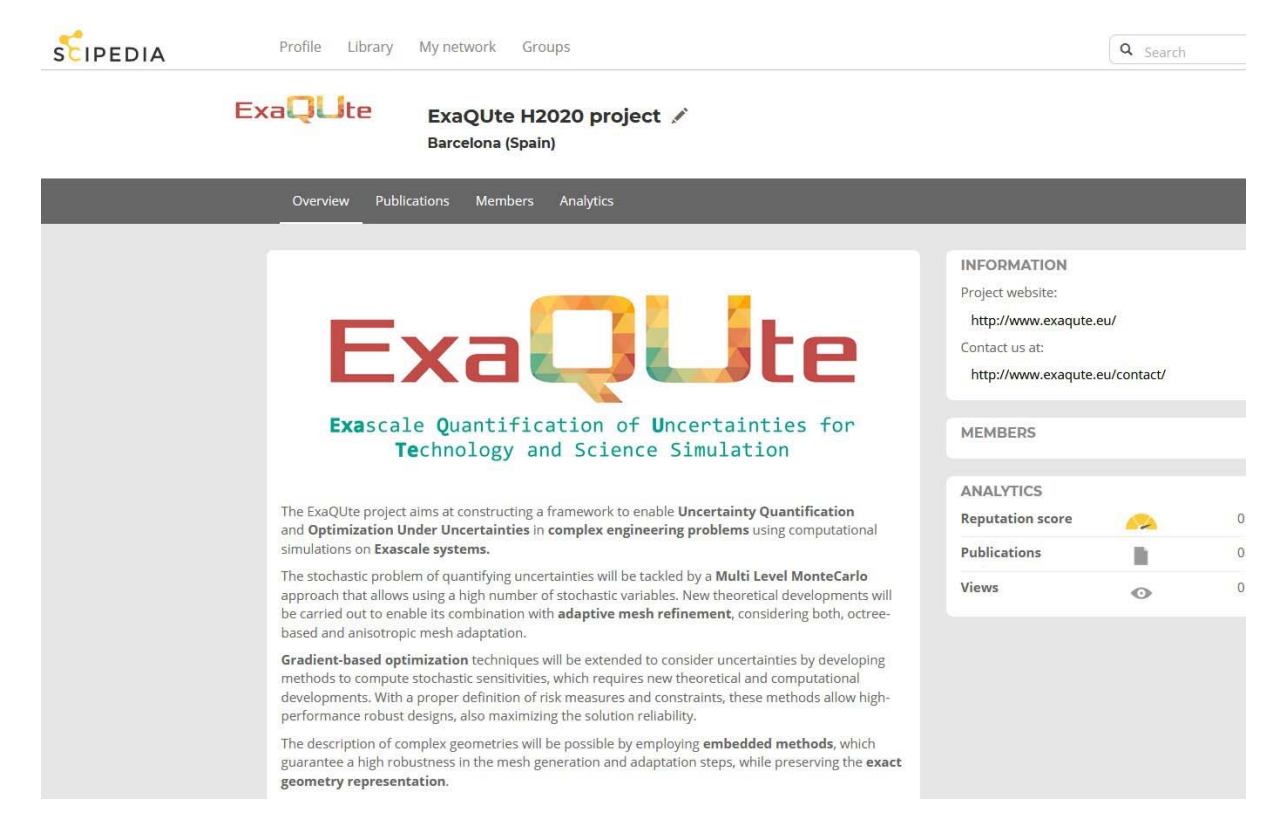
Figure 2: Scipedia repository to share open documents

In parallel, PU documents related to this project will be uploaded to the ExaQUte customized repository created under the Open Science Platform Scipedia, available at https://www.scipedia.com/institution/exaqute.eu, a snapshot of which is shown in Fig. (2).